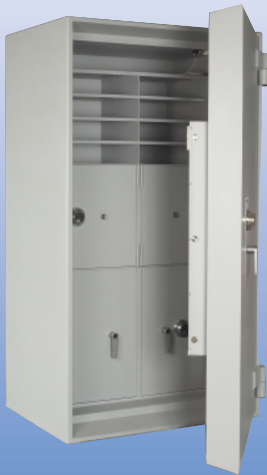
Large 36" W x 72" H x 30" D TR/TL 30 with interior layout for teller trays and cash storage.