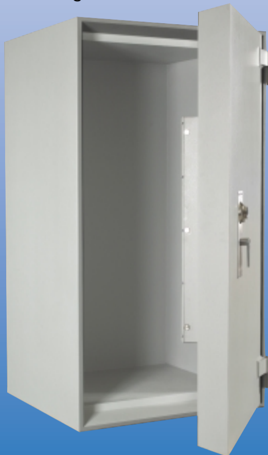
Chest interiors may be arranged in any modular or custom configuration.