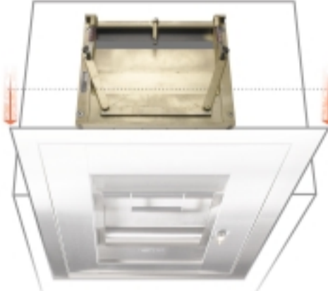
If depository head is removed, closure device snaps shut instantly to deny access to chest and its contents.