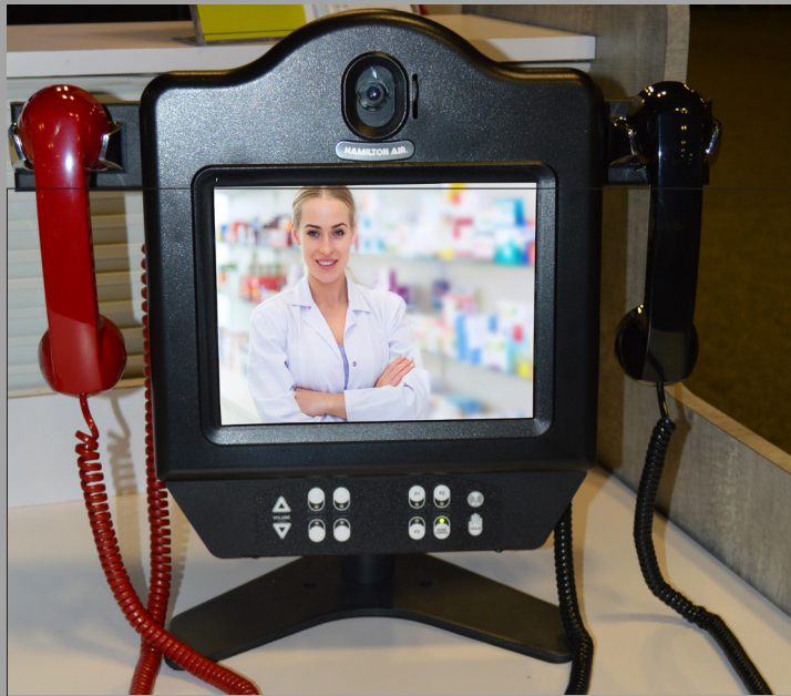
DUAL LANE PHARMACIST UNIT

The Hamilton Pharmacy Audio and Video offerings are designed with the highest clarity to make the drive-thru experience personal and easy as possible, for both customer and pharmacist.