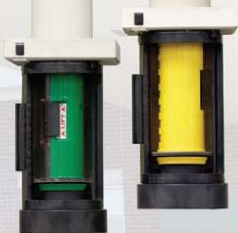
Standard Overhead Teller Terminals