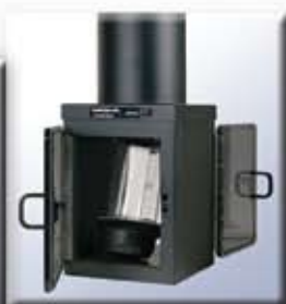
Double-Sided Upsend Teller Units